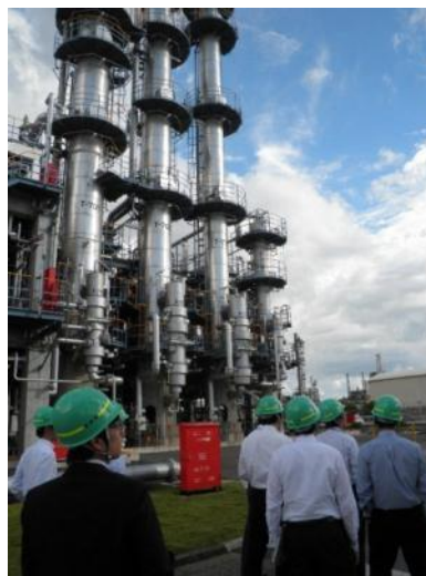
Plant tour for institutional investors